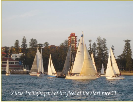
Zilzie Twilight part of the fleet at the start race 11