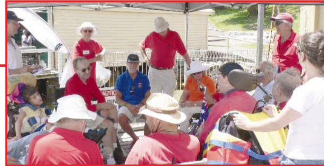
The results are announced