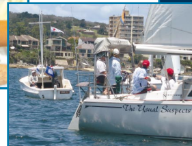
Everyone looking a little suspect, on the start line?